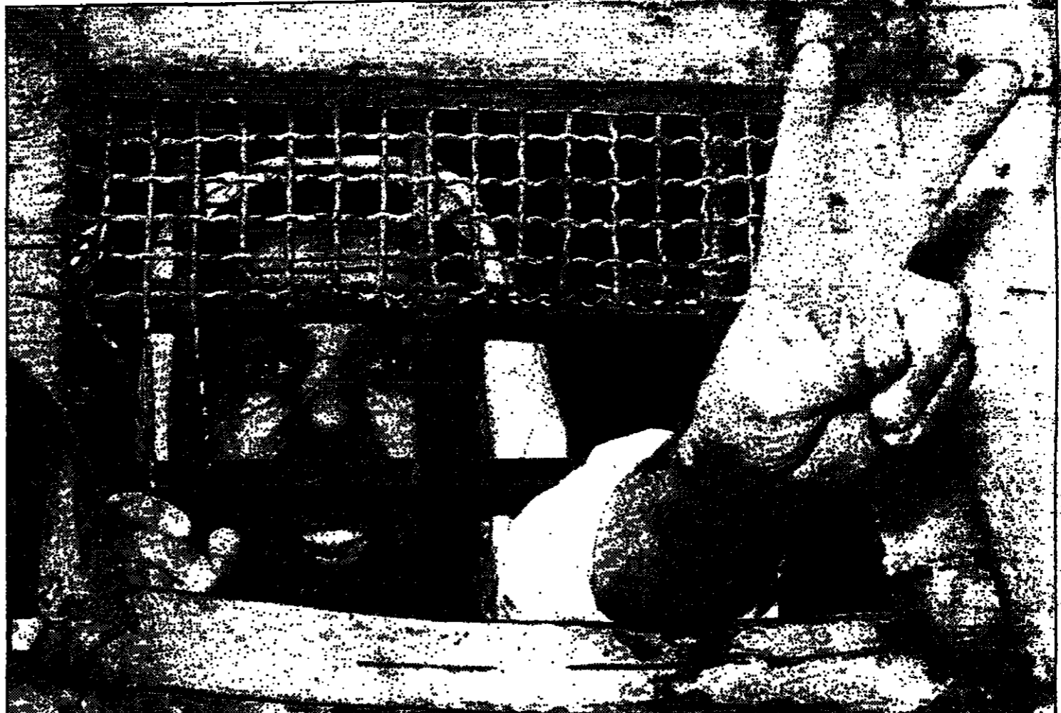
A Moslem militant waves the victory sign as he leaves a Cairo state security court yesterday. The court sentenced five Moslem militants to death for killing civilians and policemen in the south in 1993.

Klaus told reporters his country still expected to be among the first to join the alliance and added: "We do not think our membership is aimed against Russia." However, the Lisbon meeting did reach agreement on an issue of concern to Russia - adapting and extending a Cold War-era arms treaty which Moscow says no longer reflects reality. A new round of talks on conventional arms reductions in Europe is expected to start in Vienna in January as a result. The crises in Belarus and Serbia also detracted from the summit's intended harmony. Western nations told Belarus President Alexander Lukashenko, accused of trying to acquire dictatorial powers, to put the former Soviet republic back on the track to democracy. A defiant Lukashenko responded by telling leaders to mind their own business.